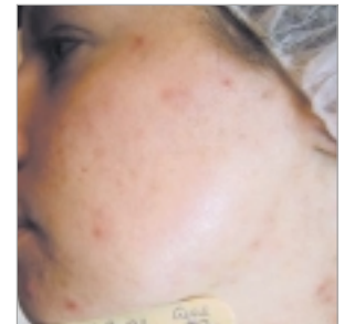
before and after 4 bi-weekly treatments