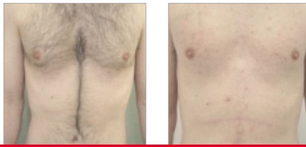
before and 10 weeks after 3 treatments