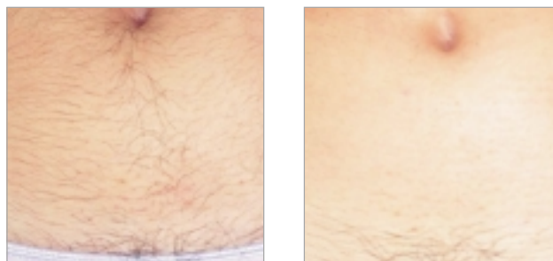
before and 6 weeks after 4 treatments