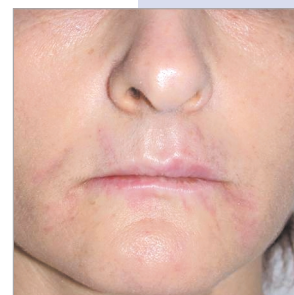
Wrinkles - before and after 6 treatments