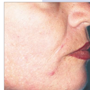
Acne scars - before and after 5 treatments