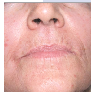
Wrinkles - before and after 5 treatments